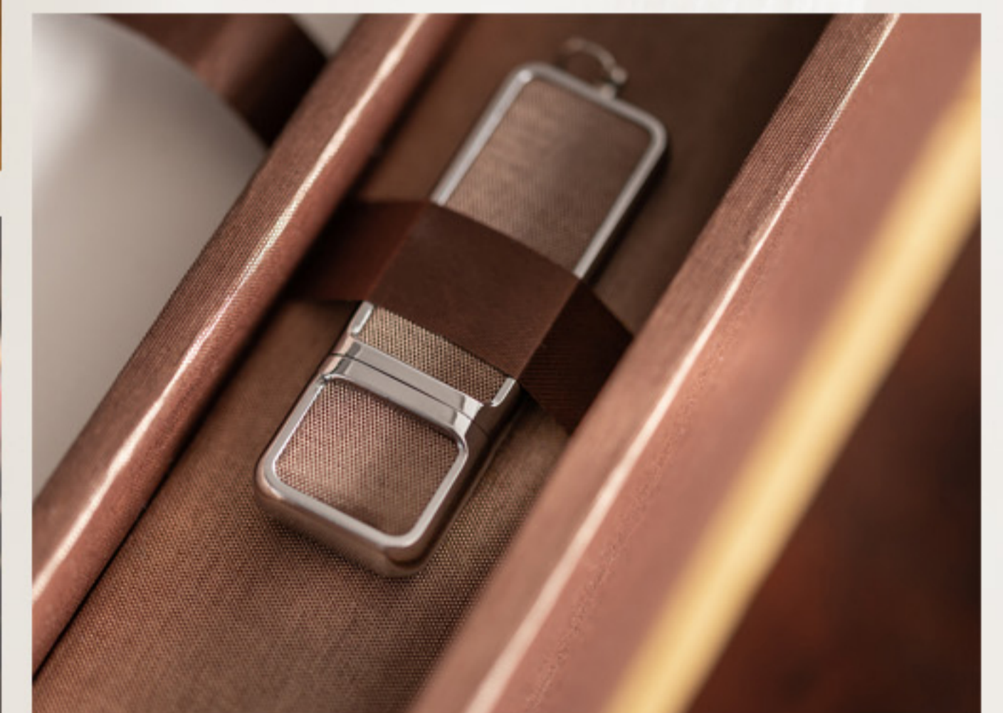
selection of covers and finish available.